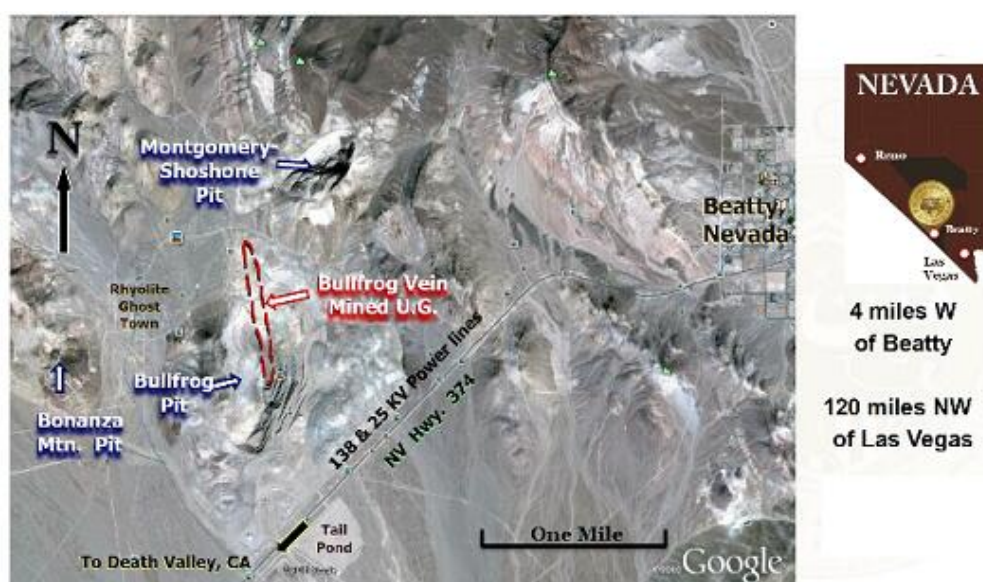
Figure 1. Project Location

The central part of the Bullfrog Mining District lies approximately 4 miles west of the town of Beatty, which is in southwestern Nevada (Figure 1). Beatty lies 120 miles northwest of Las Vegas, via U.S. Highway 95, and 93 miles south of Tonopah, also via U.S. Highway 95. The property is accessed by traveling approximately four miles west from Beatty on Nevada Highway 374, which intersects the southern block of the Company's claims. The remaining claims are accessed by traveling north for four miles on various improved and unimproved roads to the northern end of the Company's claims. Figure 1 shows the Project location and Barrick's open pit and underground mines.